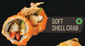
SOFT SHELL CRAB